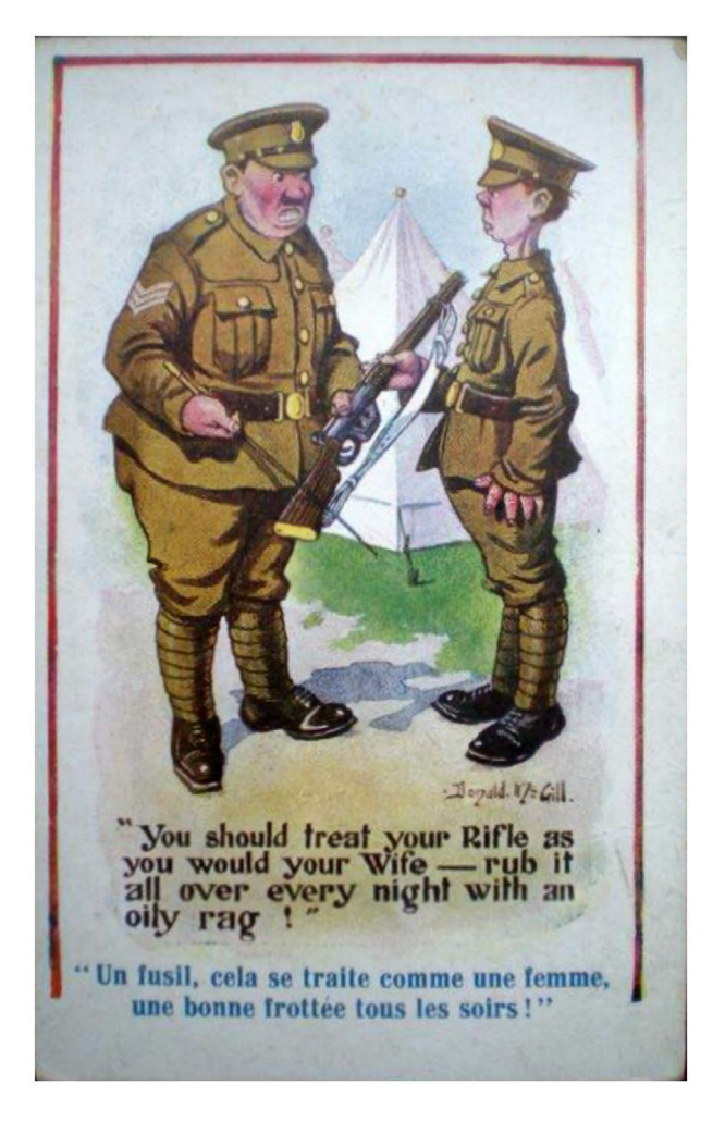
FIGURE 3. First World War postcard by Donald McGill.

A less dramatic example is the following poem from Bentley's Miscellany of 1841, which applies 'Brown Bess' as a specific personal name for a weapon: