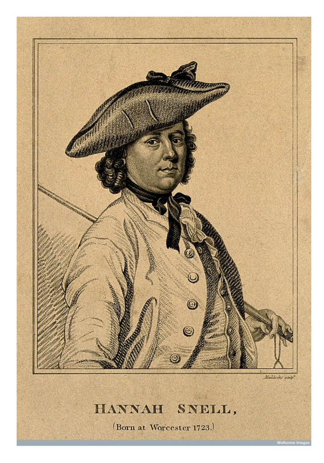
FIGURE 2. The celebrated soldier and marine Hannah Snell, c1750. Of note here for her popularisation of the musket nickname, she also carried one in anger. Indeed, as a lower class woman turned common soldier, Snell herself was something of a 'Brown Bess'.